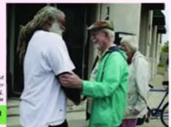
Area residents meet and greet at the Detroit/Grosse Pointe border on September 21, 2014.