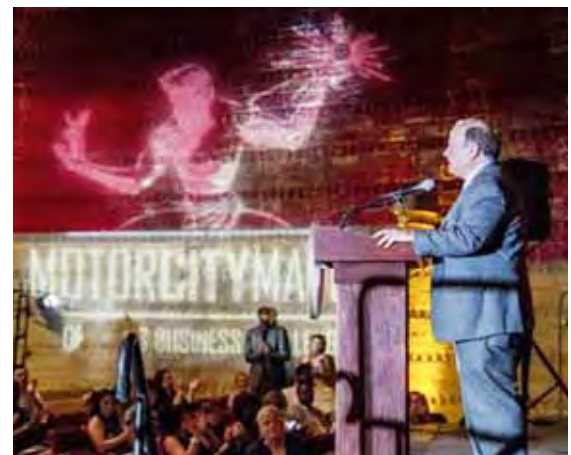
Mayor Mike Duggan addresses the crowd.